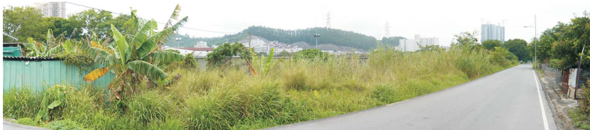
Existing view from Lin Ma Hang Road Towards the Project Site.